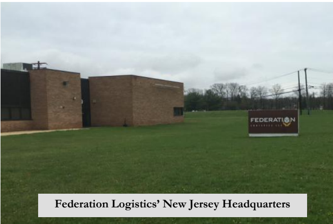
Federation Logistics' New Jersey Headquarters